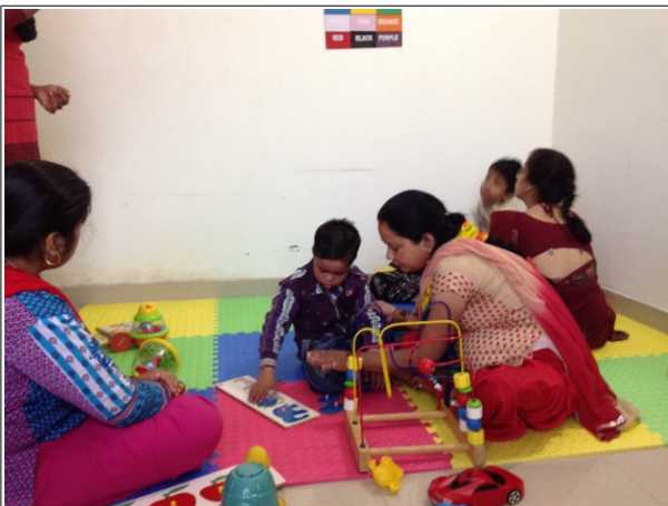
The little ones with their mothers

We now have a regular group of five children aged 7 to 13 and a new group of four children aged 3 to 6, with their mothers, twice a week for the early intervention programme. In response to their mothers' requests, we are hoping to gradually increase the frequency for the younger children to five days a week.