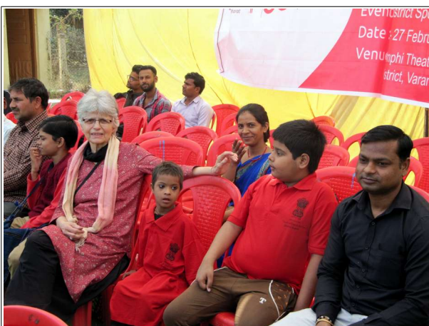
Waiting for the opening ceremony of the Special Olympics

We also took part in the Special Olympics organised by the Varanasi Ministry of Sports, for children and young people living with disabilities. Three of our children participated in ball throwing and in a 20 meter race.