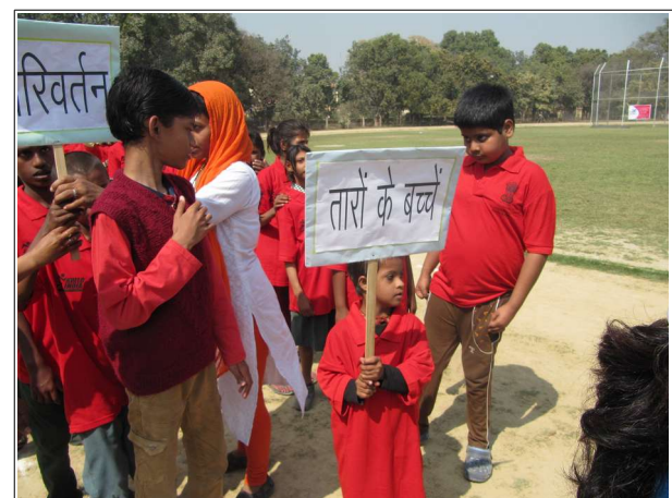
Each children's group from different schools in procession

Our school has also had an impact in the University of Varanasi, Banaras Hindu University, as one of their students is currently doing an internship with us as part of her research project and PhD related to autism. We recently received an internship request from a trainee clinical psychologist.