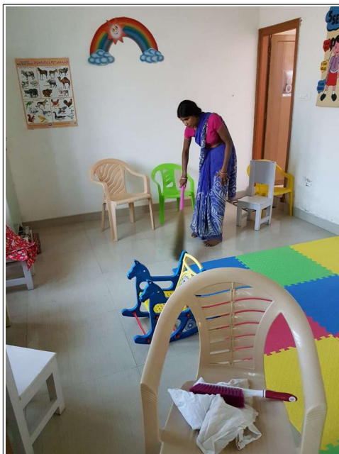
Cleaning the small children's room