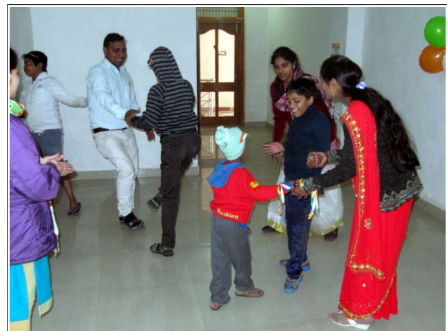
26 January - Republic Day, a public holiday in India