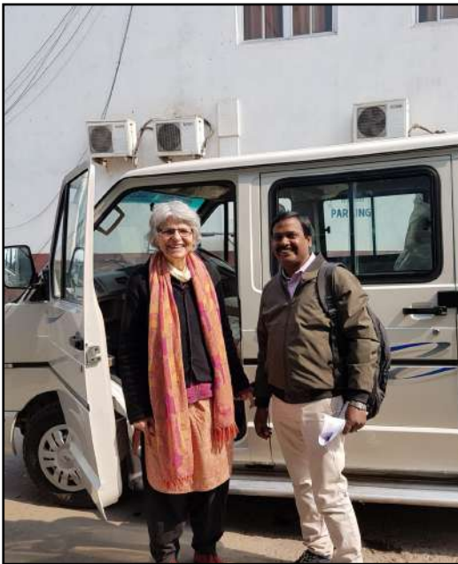
Finally a new bus ! Our Tata Winger

• On 2 February 2020 we organised a training day for the staff of the school, the theme of which was personal development: "Personal motivation, self-respect, trust and communication between colleagues".