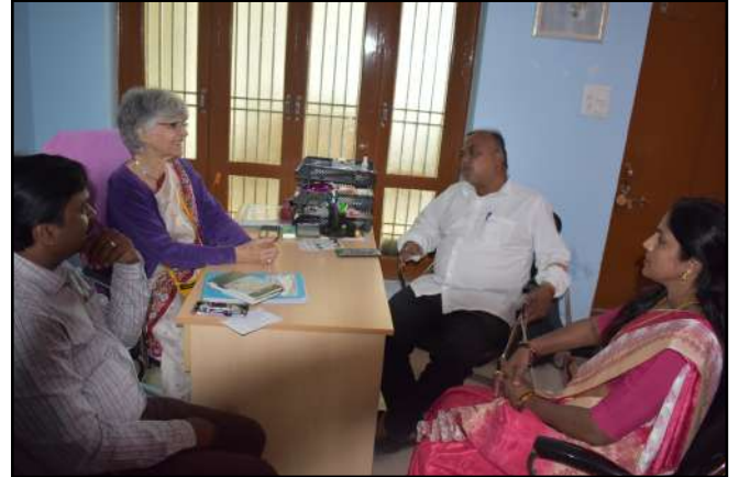
Visit from the homeopathic doctor and politician