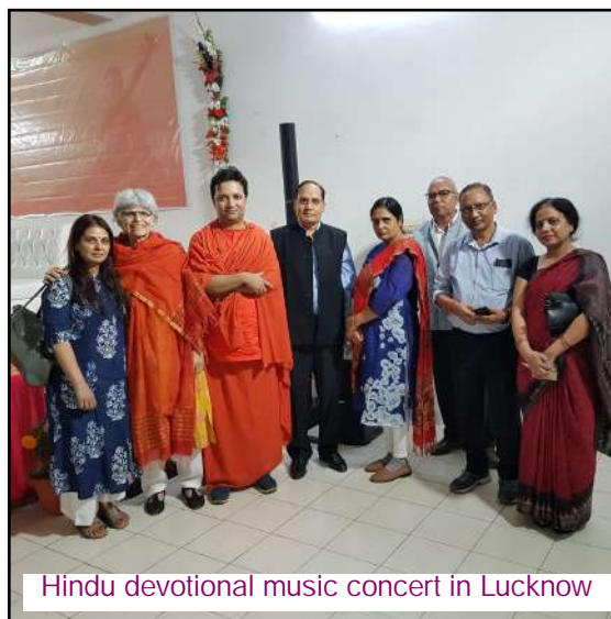
Hindu devotional music concert in Lucknow