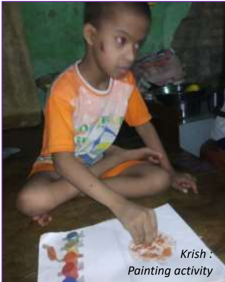
Krish : Painting activity

The progress achieved worldwide, at the cost of enormous efforts, to extend access to education, could slow down with the prolonged closure of schools. The alternative solutions, such as distance learning, are not accessible to all, due to a lack of means of connection.