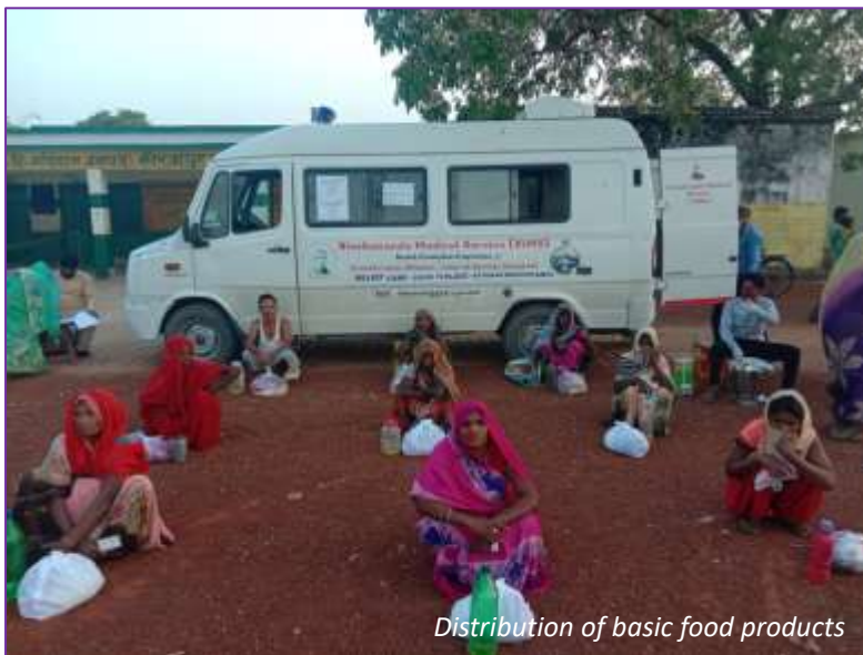
Distribution of basic food products

have been distributing food in the villages around Benares. We have also been providing food to one of the families at the school.