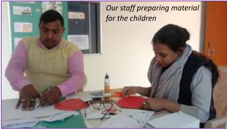
Our staff preparing material for the children