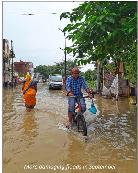
More damaging floods in September