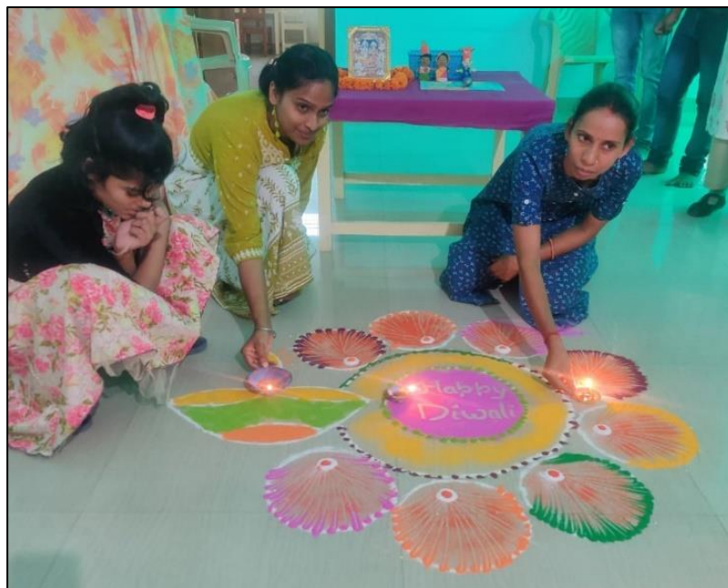
Diwali, the festival of light and rangolis