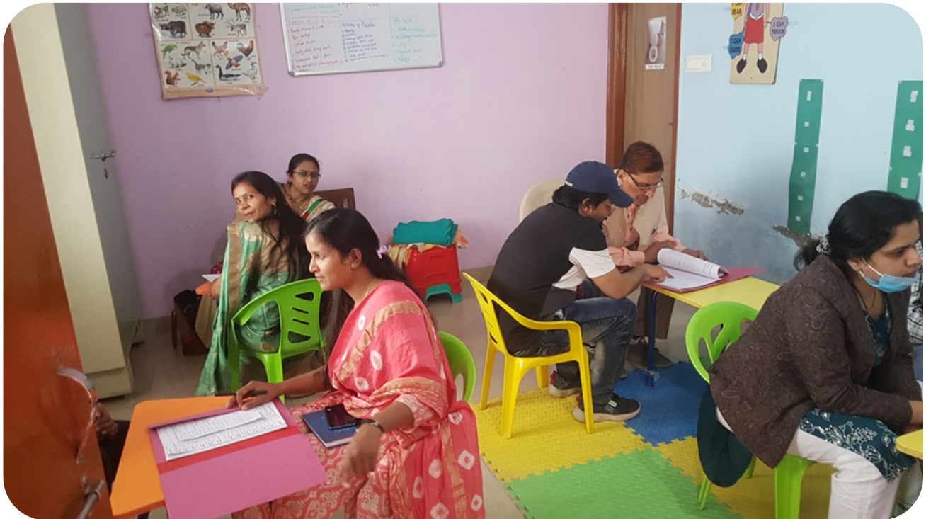
Collaboration with parents about the "ComDeall Communication" assessment

It was an intense activity that provided everyone with a clear structure in order to follow the child, her/his difficulties, potential and progress.