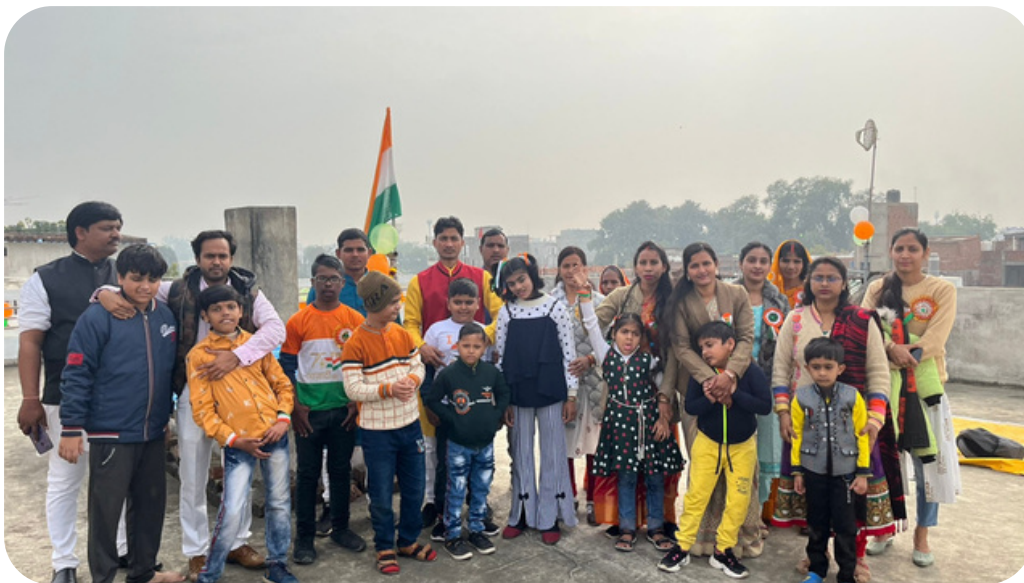
Republic Day celebration at Taaro ke Bacche

Taaro ke Bacche, Rehabilitation Centre and Special-needs School, is pleased to send you this Newsletter for the month of April 2023.