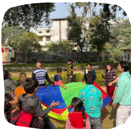
Outing at the Nehru Park