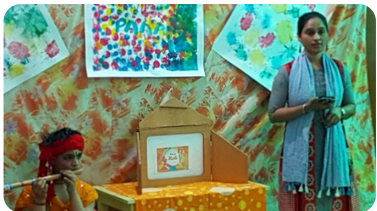
Holi in TKB